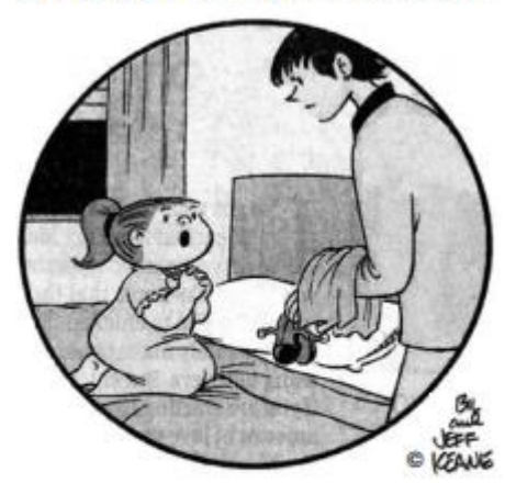
"I couldn't think of any new prayers, so I just said the Pledge of Allegiance instead."

from JoyfulNoiseletter.com Reprinted with permission of Bil Keane