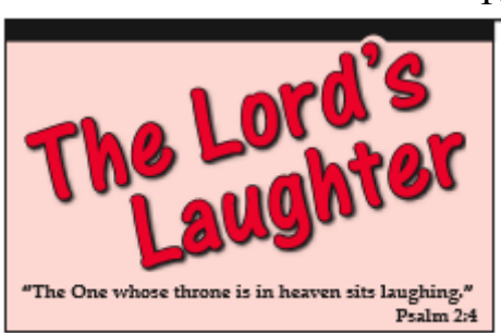
Jokes pastors can tell

police officer saw a man driving with a bunch of penguins in the backseat of his car. The officer pulled the man over and asked, "Where did you get those penguins?" The man replied, "I found them wandering on the side of the road."